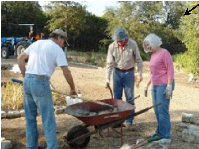
“Cement Mixer Put-Ti Put-Ti” –