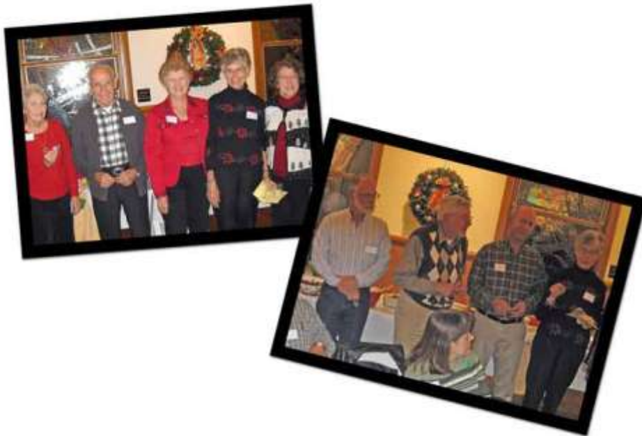
Five and ten year pin winners